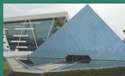
E - City