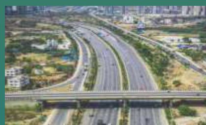
Mall RRR ( Regional Ring Road)