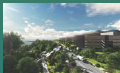
Hyderabad Pharma City