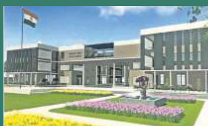
Ranga Reddy Dist. Collectorate Office