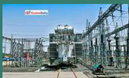
765 / 400 KV Power Grid