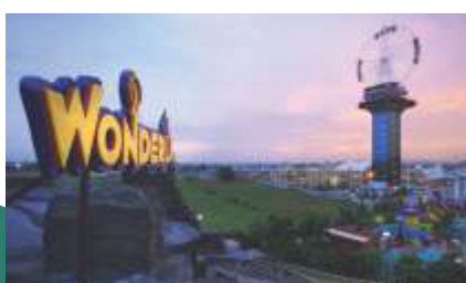
Wonderla Amusement Park