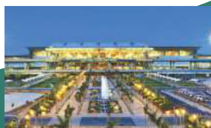
Rajiv Gandhi International Airport