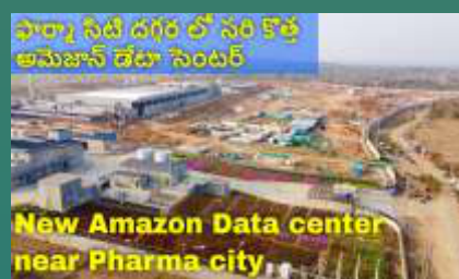
Amazon Data Centre