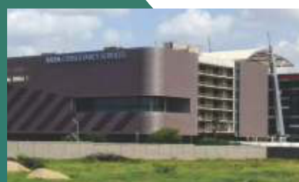
Tata Consultancy Service Adibatla